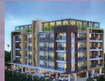
ZINIA 2 - EDAPPALLY