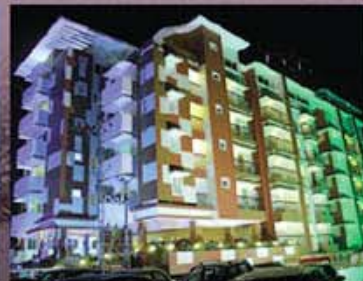
MON PARADIS - KALAMASSERY