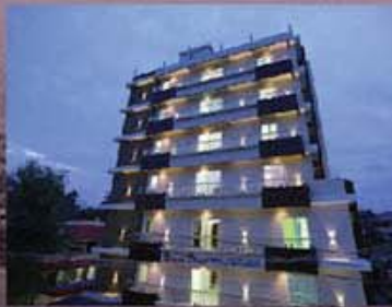
VELVETUDE - EDAPPILLY