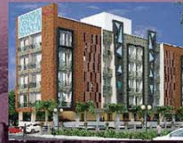
IBIZA - KALOOR