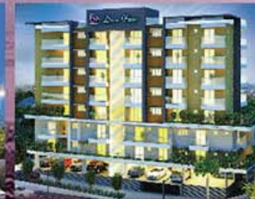
MISTLETOE - TRIPUNITHURA