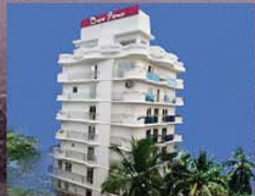
CASA GARDENZA - KADAVANTHRA