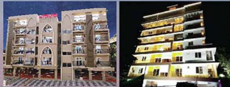
ESTELLA 2 - KALAMASSERY CYNOSURE - KADAVANTHRA