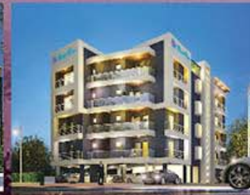
IBIZA 2 - KALOOR