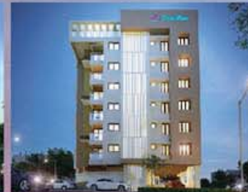
VELVETUDE 2 - EDAPPALLY