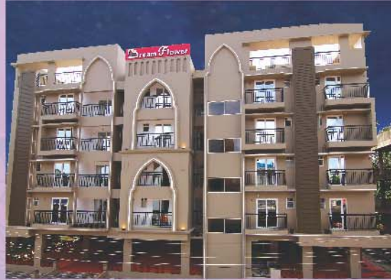
ESTELLA 2 KALAMASSERY