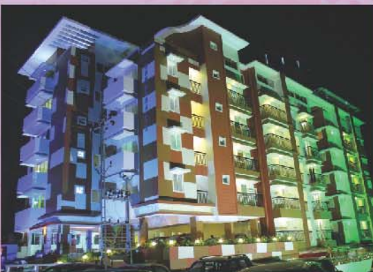
MON PARADIS KALAMASSERY