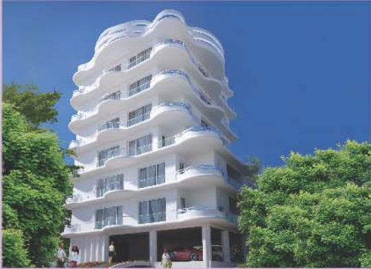
CASA GARDENZA KADAVANTHRA