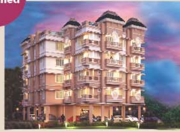
VELVETUDE - 3 EDAPPALLY