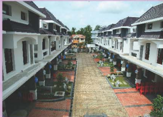
VILLA RIO VYTTILA