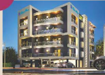
IBIZA 2 KALOOR