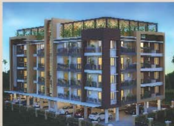
ZINIA 2 EDAPPALLY