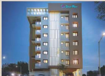
VELVETUDE 2 EDAPPALLY